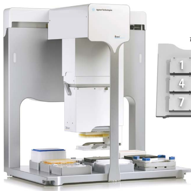
Top View of Bravo Deck

Agencourt PCR Purification for the Agilent Bravo Automated Liquid Handling Platform